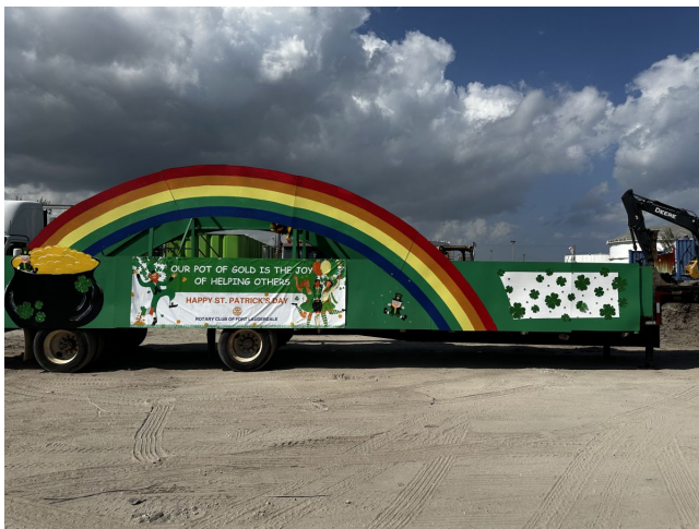
Back to CBI before dismantling.