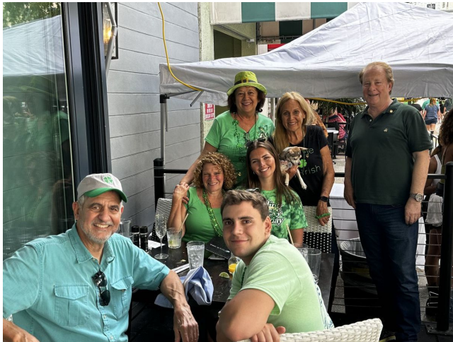
Post parade lunch at the Riverside